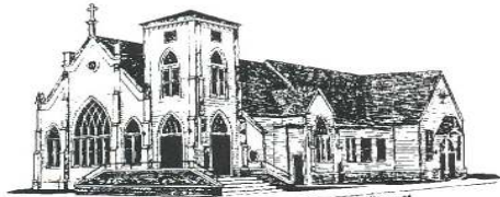
Corner of Clinton and State Streets